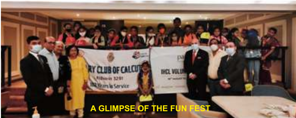
A GLIMPSE OF THE FUN FEST

RC Calcutta, in association with Taj Bengal Hotel as part of their CSR commitment, organised a function FUN FEST for the children of our RCC SCIR on 2nd September at Taj Bengal Hotel. The children were engaged with musical chair game and sit-and-draw contest on a fun-filled afternoon.