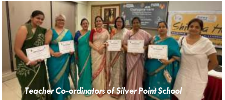
Teacher Co-ordinators of Silver Point School